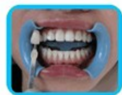
After one treatment

What is the difference between Beyond WhiteSpa and whitening in the dental office? The Beyond WhiteSpa system is the same technology used in dental offices for power whitening and the results are comparable. The WhiteSpa whitening gel is designed for safe treatment by aesthetic professionals.